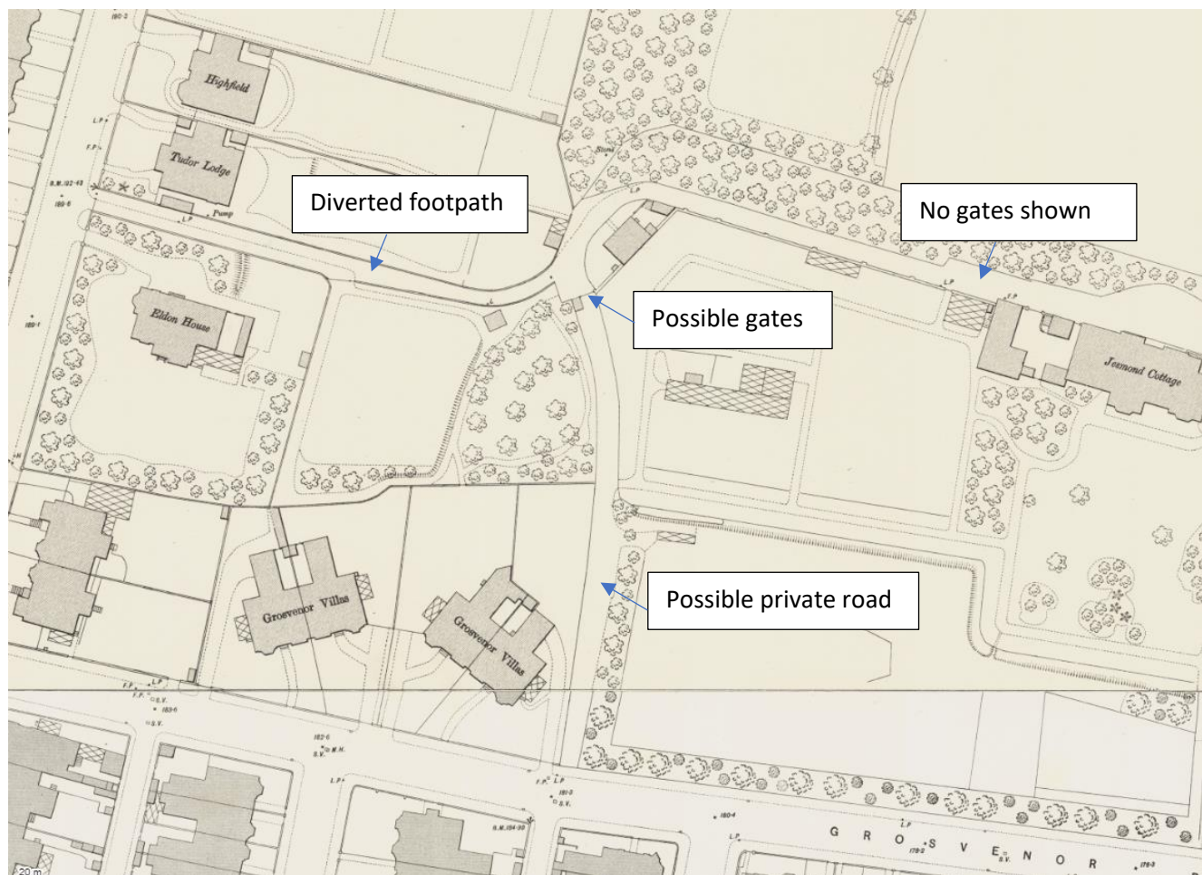
Ordnance Survey 1894 – Town Plan of Newcastle upon Tyne, Gateshead, and Environs Sheet 6